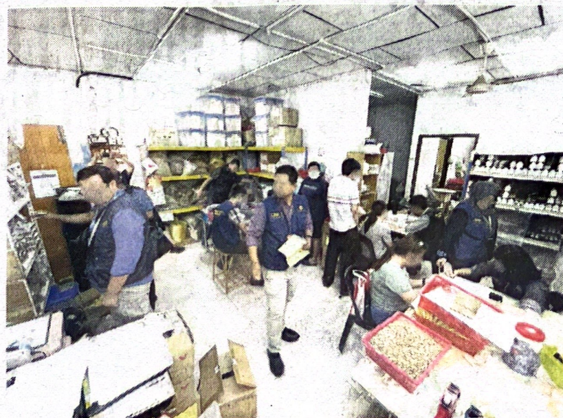
SEKITAR operasi bersepadu Cawangan Penguatkuasaan Farmasi (CPF) Jabatan Kesihatan Negeri Pulau Pinang ke atas enam premis di sekitar Kepala Batas pada Selasa lalu.

Bagi kesalahan pertama, hukumannya ialah denda tidak melebihi RM25,000 atau penjara sehingga tiga tahun atau kedua-duanya; manakala bagi kesalahan berikutnya, dendanya boleh mencecah sehingga RM50,000 atau penjara sehingga lima tahun, atau kedua-duanya.