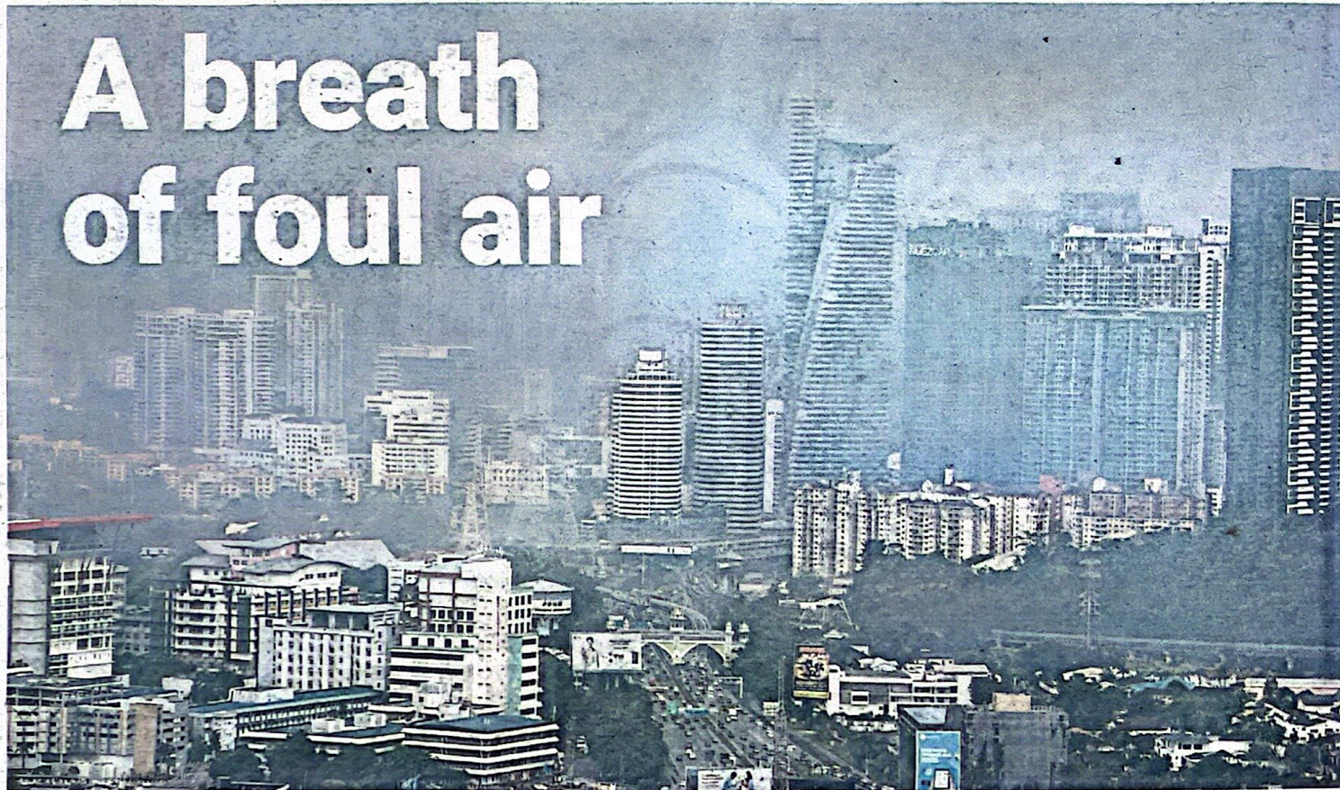
Veil of grey: A photo taken around 1.30pm shows worsening haze conditions along the Federal Highway between Petaling Jaya and Bangsar. The Kuala Lumpur city skyline, usually visible in the background, is completely obscured by the dense smog, highlighting the seriousness of the air pollution.

"If the water is murky, then less light will penetrate the